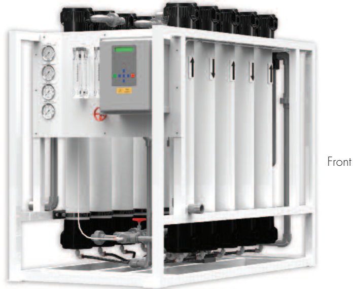
DT-20000 Reverse Osmosis System