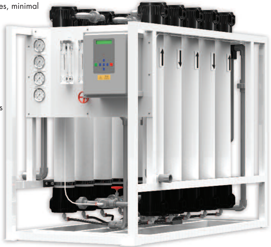
DT-20000 Reverse Osmosis System Front

DT-Series Reverse Osmosis Systems have been engineered for capacities ranging from 10000 – 20000 gallons per day.